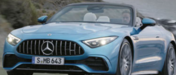
European image shown.